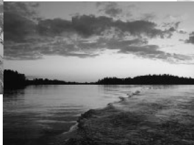
Lori Beesley First Place Landscape