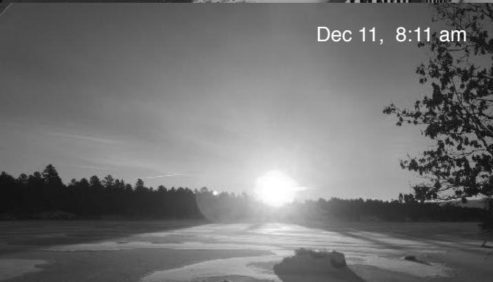
Dec 11, 8:11 am