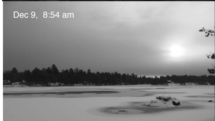
Dec 9, 8:54 am

From one day to the next... December mornings on Kahshe