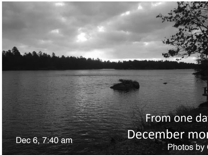
Dec 6, 7:40 am