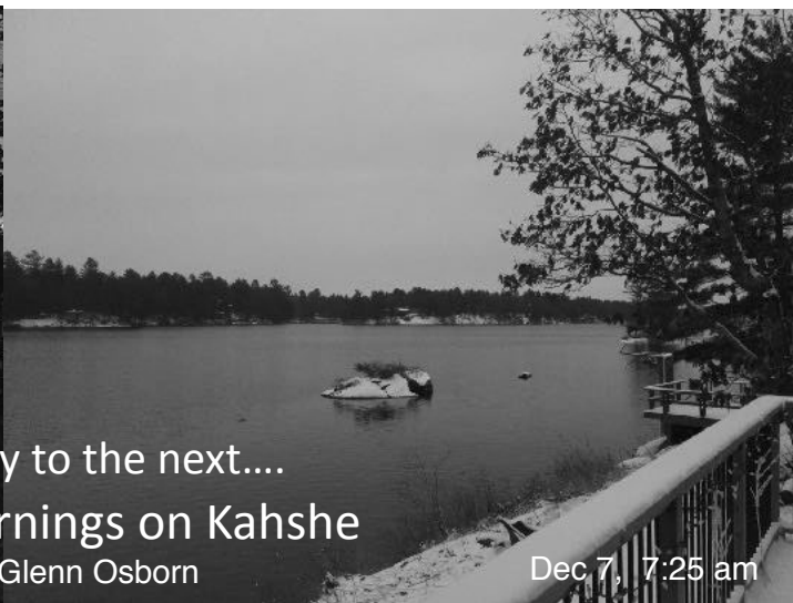
Dec 7, 7:25 am

From one day to the next... December mornings on Kahshe