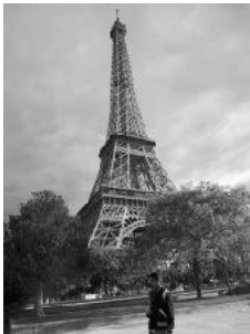
Eiffel Tower Paris France

I know that many of you love the winter and all the winter activities that Canadians have taken to in order to justify living in the Great White North — skiing, tobogganing, skating, curling, hockey, ice-fishing, et al. But there are many, like my wife, Anne, who do not like to get any closer to winter than a picture on a calendar or Christmas card. If you are one of these, this Photo ID Contest (PIDC) is for you. Below and scattered throughout the newsletter are 13 pictures of not-Kahshe in the not-winter . Identify as many of them as you possibly can in as much detail as possible (building or landscape feature, town/city/province, and country) and you could win a Gift Certificate for the Kahshe Boutique . Send your best guesses to keithonkahshe@bell.net by midnight on June 30 (by which time the weather will be a lot warmer!). The winners, the names of the photographers and the locations will be announced at the AGM on July 8th , on the KLRA website ( www.kahshelake.ca ) after the AGM, and in the September Krier . Good luck , Example: This is an easy one. Now try out the rest.