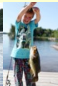
This one didn't get away!

[Unfortunately lack of space prevents a full report of the Picnic and the Fishing Derby in this issue.