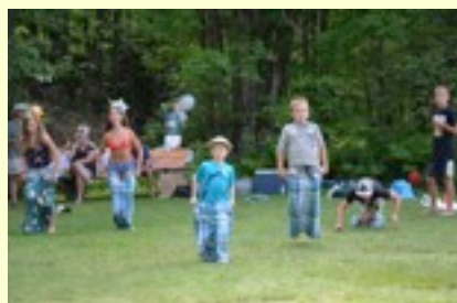
The Pillow Case Race..... and the smallest shall be first!