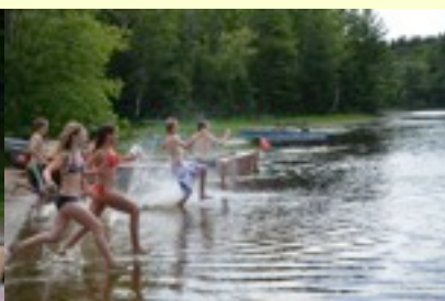
The Water Race