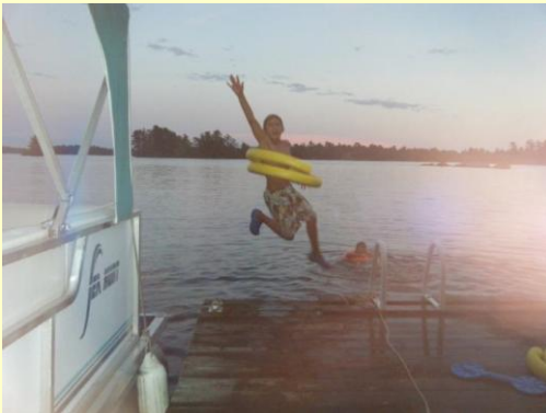
Super Graham by Libby (aged 5)