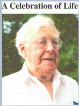
A Celebration of Life