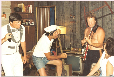
The Wharf Rats