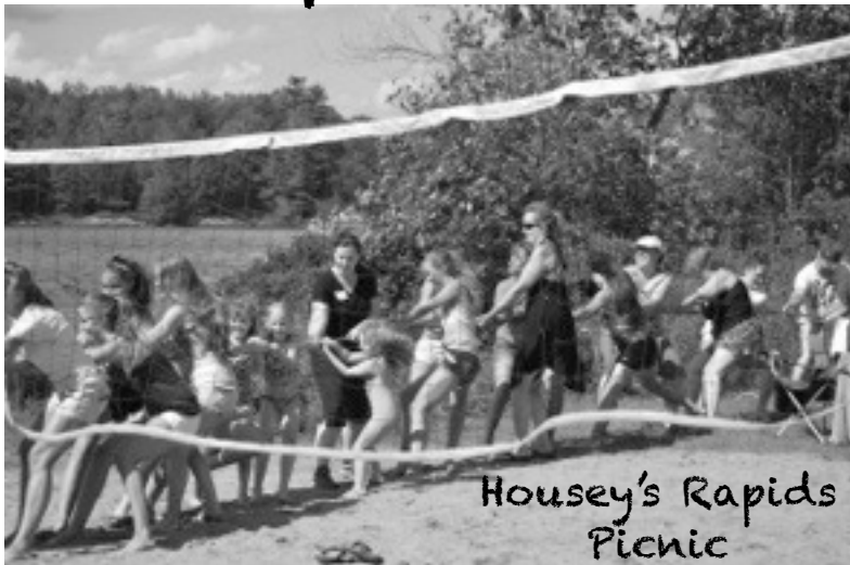
Housey's Rapids Picnic