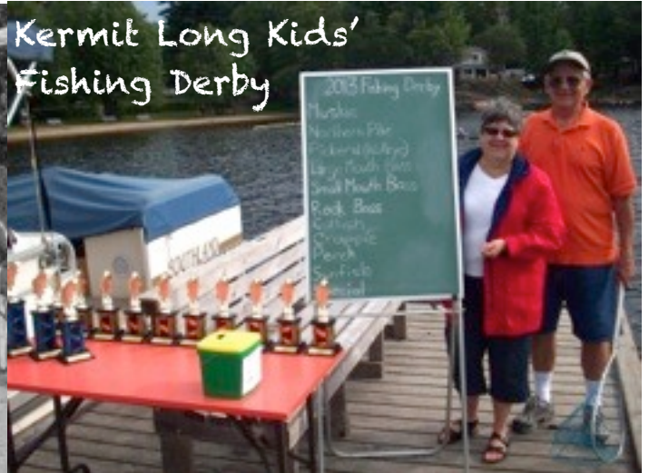
Kermit Long Kids' Fishing Derby