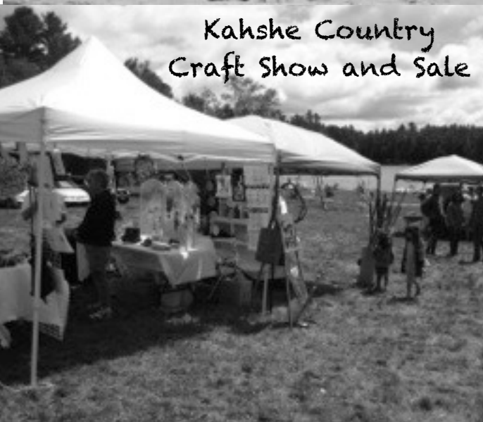
Kahshe Country Craft Show and Sale