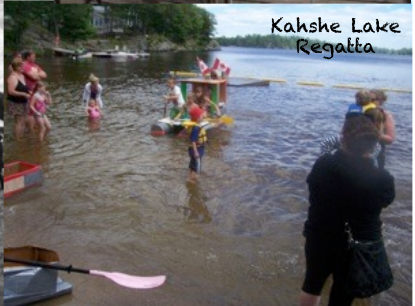
Kahshe Lake Regatta